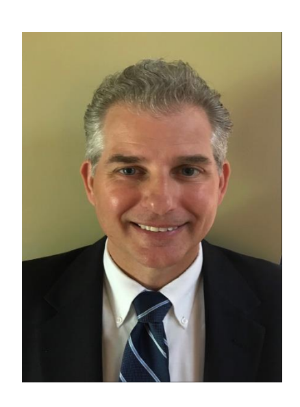
Acting Chief of the Office of Engineering and Technology