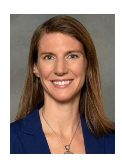
Regional Director for the Indo-Pacific