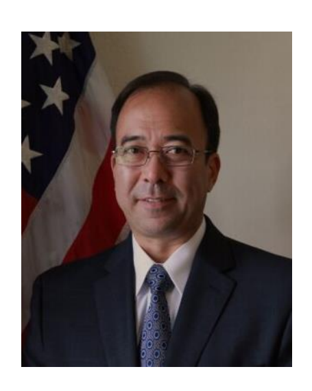
Chargé d'Affaires U.S. Embassy Bangkok