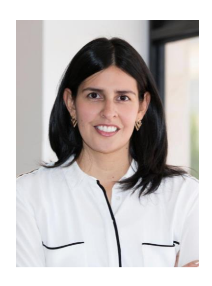
President Dynamic Spectrum Alliance