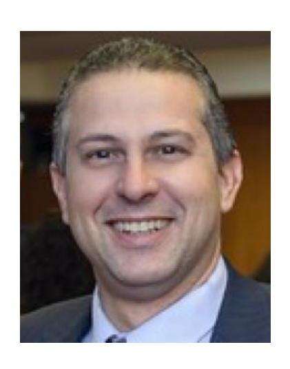
Chief of the International Bureau