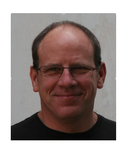
Public Policy Director Meta Platforms