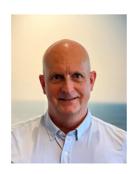
Vice President of Technical Standards