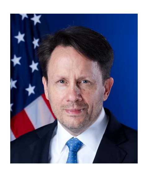
Minister Counselor for Commercial Affairs and ASEAN Regional Senior Commercial Officer