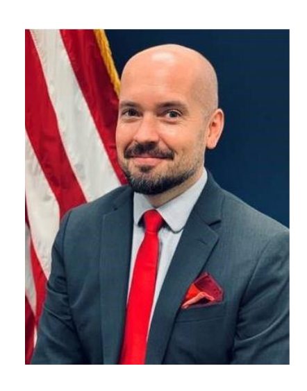
Deputy Economic Counselor