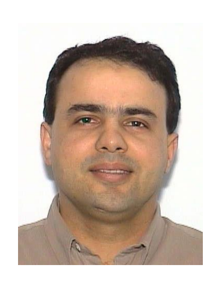
Principal Wireless System Architect